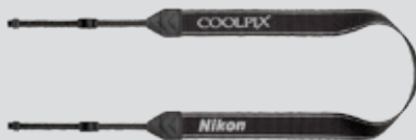
AN-CP21 Camera Strap