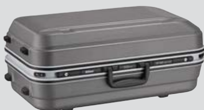
Lens Case CT-505 (included)