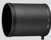
Lens Hood HK-34 (included)